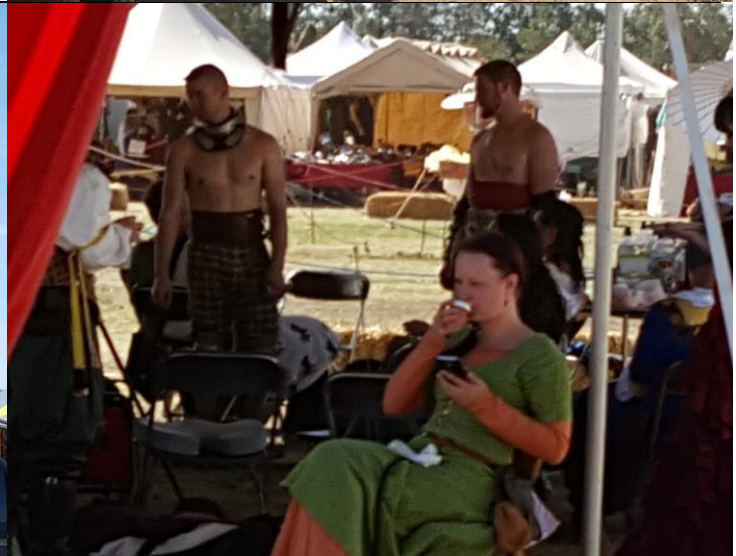
Clockwise from upper left – Plains Indians; street scene; Viking war truck (I wish I had a better view of the red dragon heads projecting above the cab); getting ready for a tourney – eye candy for your editor