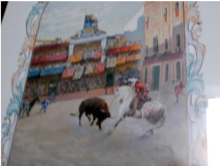
Left and right – early rejoneando style bull fighting.