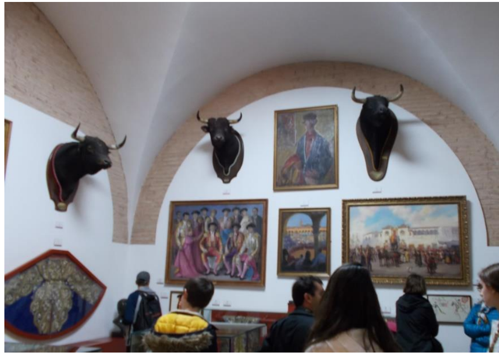
Above – the cape on the wall is for display, parading around, not for actual fighting.