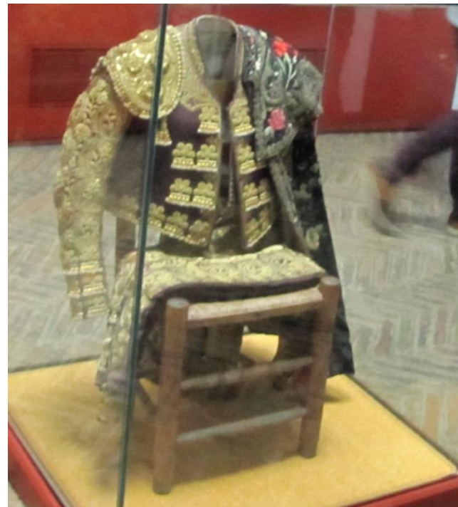
Selection of costumes from the Seville bullring museum.