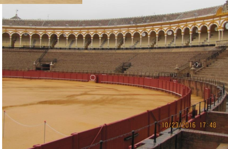
Above – the bullring in Ronda. Right, the bullring in Seville. Inset, a plush ‘brave bull’ souvenir of Ronda looking at the Spanish scenery from a train.