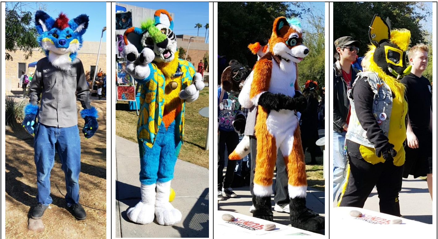
Random selection of Furrries.

items of interest to Arizona costumers. Send your submissions to editor@southwestcostumersguild.org .