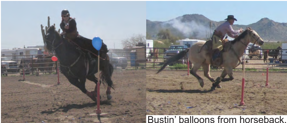
Bustin' balloons from horseback.