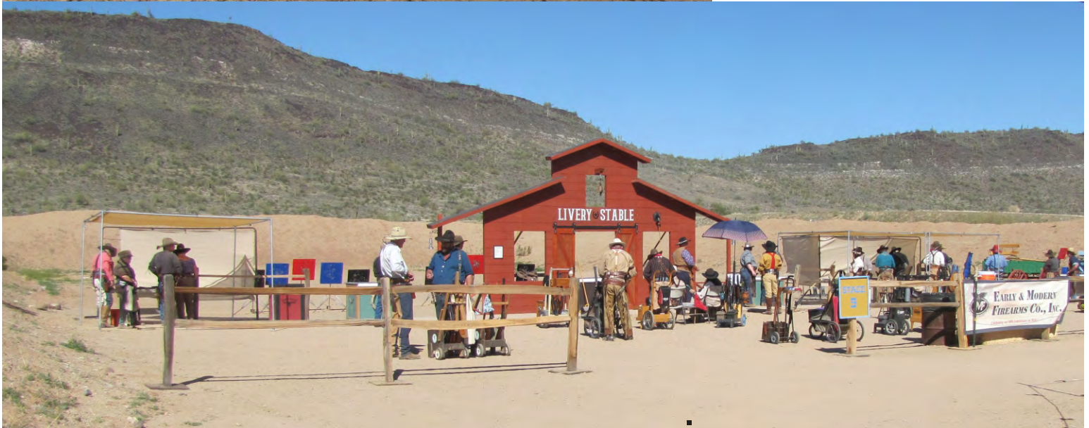
The iron targets ranges are styled to look like western movie sets