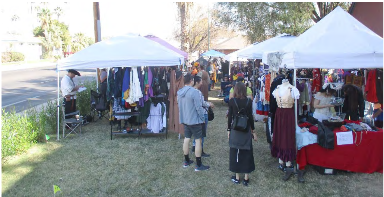
Broad view of the participant tents at Arizona Renaissance Festival Fans Garb Market