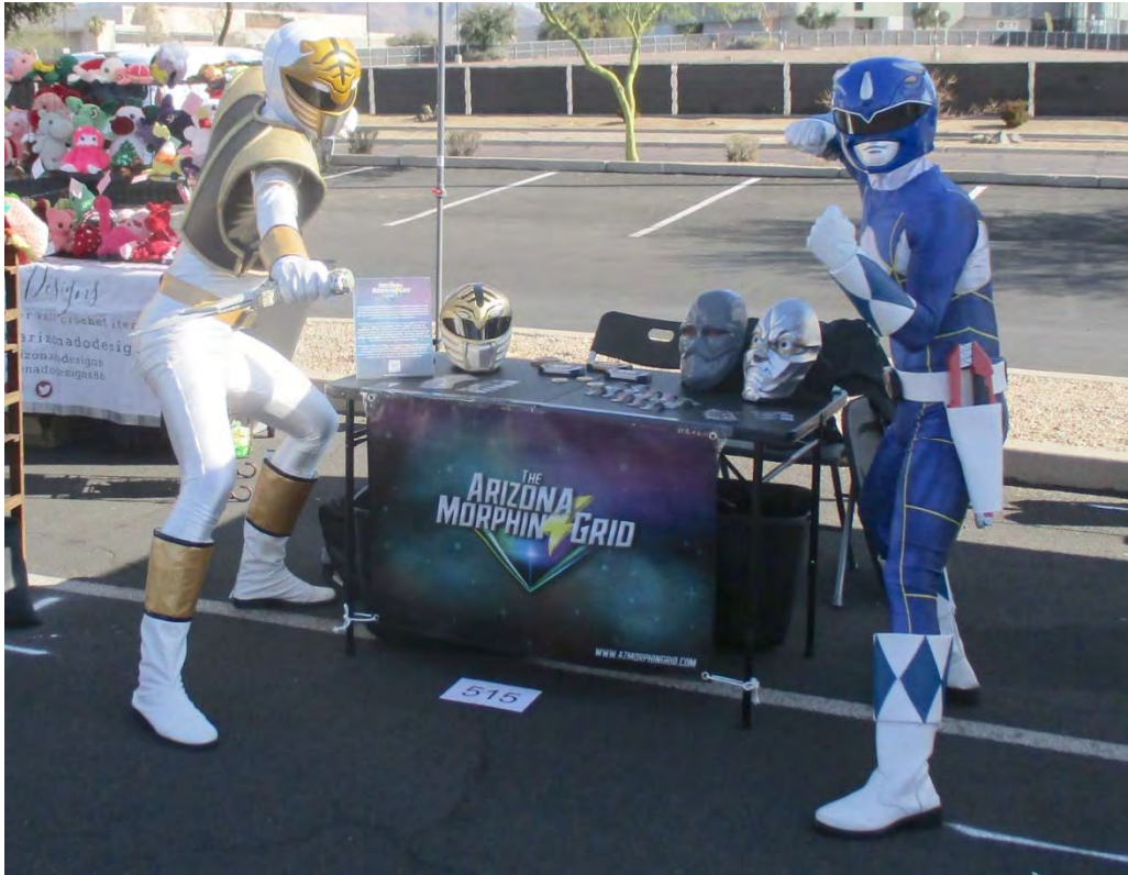
Morphin' around Superhero Saturday