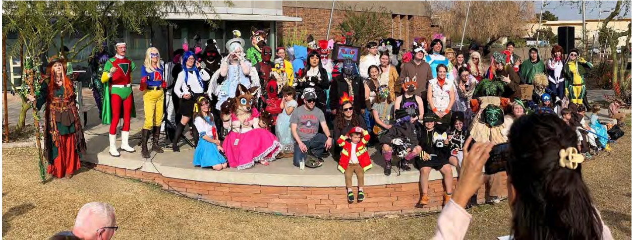
Panorama of cosplayers at Tempe FanCon